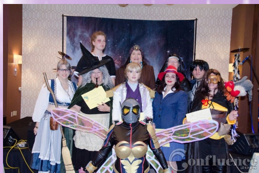
Masquerade Contest Contestants and Judges