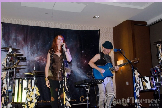
Frenchy and the Punk