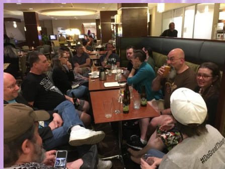
After-Hours with Fortress Publishing

This year's Confluence was one of the most enjoyable I've attended. Though my book sales in the Dealers Room were somewhat flat as opposed to last year, the programming, music, and, most importantly, the people made the event quite memorable.